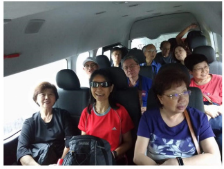
After lunch, on a 15-min journey to the venue by hotel-provided shuttle service